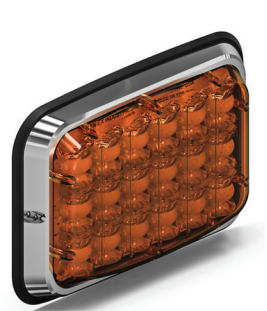
TAIL-TURN LUX TT-4600