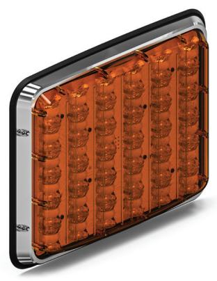
TAIL-TURN LUX TT-7900