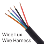
Wide Lux Wire Harness