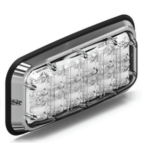
REVERSE LUX R-3700