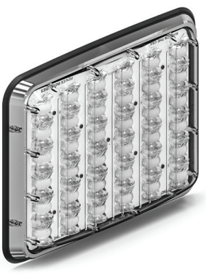
REVERSE LUX R-7900