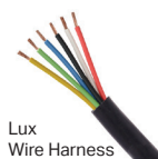
Lux Wire Harness