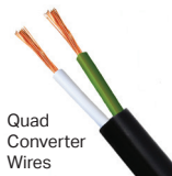
Quad Converter Wires