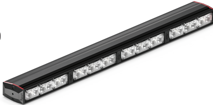
A. Fusion-S 400 Lightstick