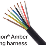
Fusion® Amber wiring harness