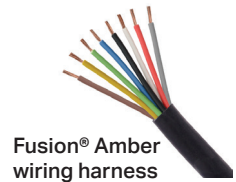
Fusion® Amber wiring harness