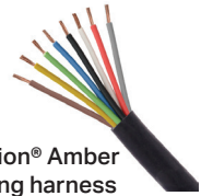
Fusion® Amber wiring harness