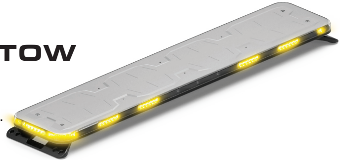
A. Fusion® Tow 60" Lightbar