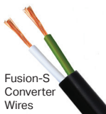
Fusion-S Converter Wires