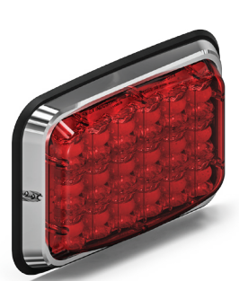
BRAKE-TAIL- TURN LUX BTT-4600