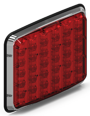
BRAKE-TAIL- TURN LUX BTT-7900