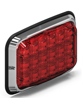
BRAKE-TAIL- TURN LUX BTT-4600