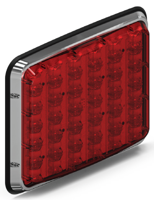
BRAKE-TAIL- TURN LUX BTT-7900