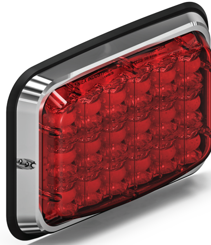
A. Brake-Tail-Turn Lux 6x4